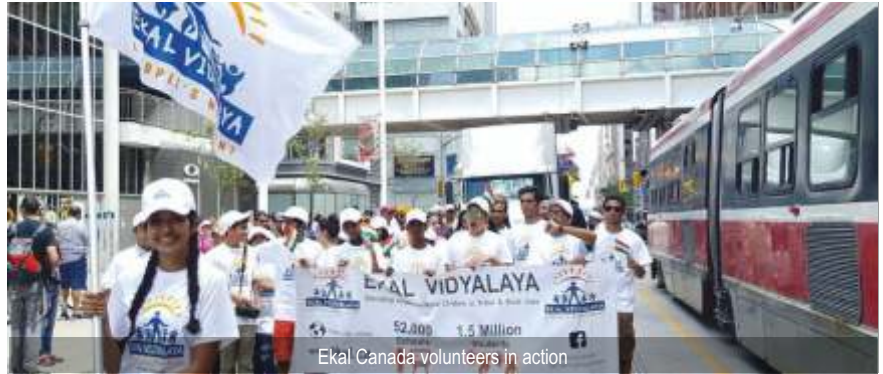
Ekal Canada volunteers in action