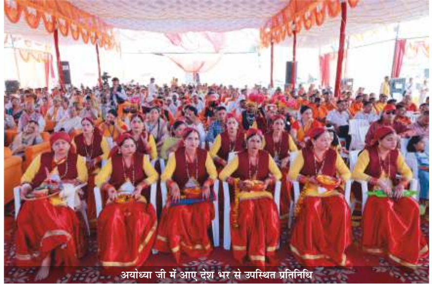
अयोध्या जी में आए देश भर से उपस्थित प्रतिनिधि

इन्होंने अयोध्या आकर एक वर्ष तक रामकथा का मर्म जाना और प्रशिक्षण प्राप्त किया।