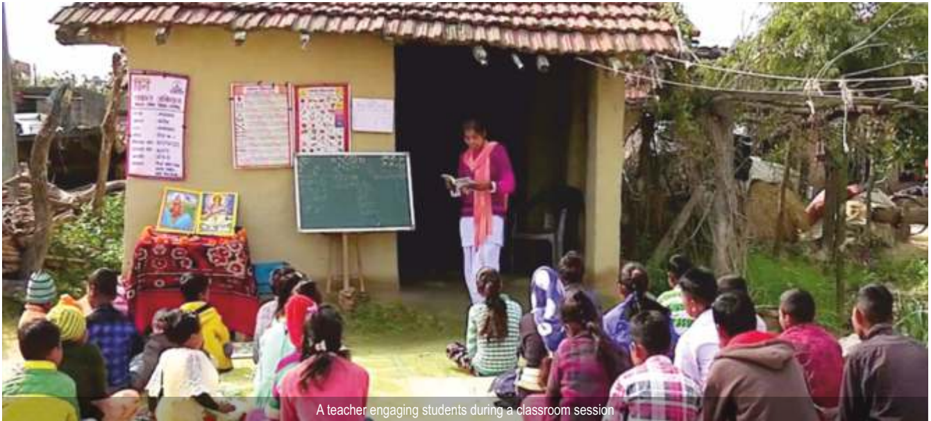
A teacher engaging students during a classroom session

for this collection. First, donations will be collected from the family of the student enrolled in the Ekal School. There was a purpose behind this collection. Such donation generates the evil practice of bhiksha (begging) in our society. The Ekal survived on outside help for some initial years, but it did not allow itself to become a government school that thrives on government crumbs. The government school merely teaches Children, which the Ekal school shapes the personalities of its students. It teaches them values along with education. Thus, Ekal sought the participation of the children's parents in the Ekal mission so that they could also be aware of and avail the facility of education.