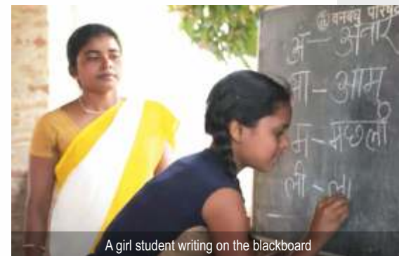
A girl student writing on the blackboard

In simple terms, self-dependence indicates that a village should muster all resources on its own for every entrepreneurship it wishes to perform. The village should formulate a budget