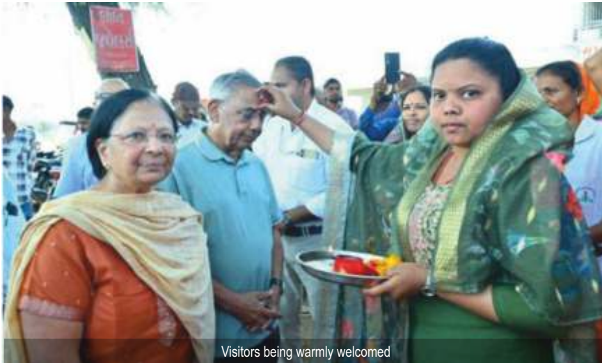
Visitors being warmly welcomed

modules, coupled with consistent mentoring and post-training support, stood as a testament to the programme's thoughtful design and execution.