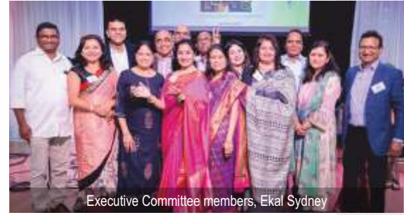
Executive Committee members, Ekal Sydney

Ekal Australia events bringing community and cause together across Adelaide, Perth, Melbourne and Sydney