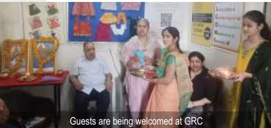
Guests are being welcomed at GRC