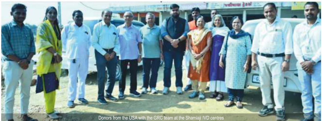
Donors from the USA with the GRC team at the Shamlaji IVD centres

One of the most impactful segments of the visit was the interaction at the Women Empowerment Centre (WEC). Here, the transformation was both visible and palpable. Women engaged in skill-based training spoke with confidence about their journeys—how new skills had not only enhanced their economic contribution but also strengthened their self-belief. The structured training