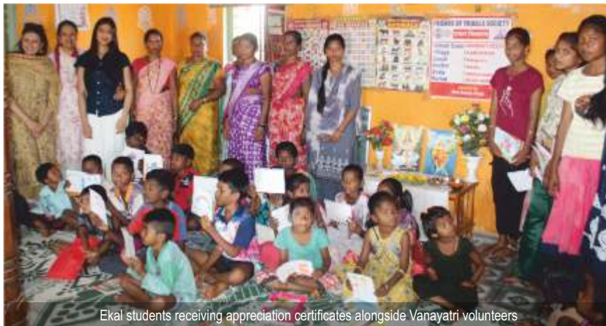
Ekal students receiving appreciation certificates alongside Vanayatri volunteers