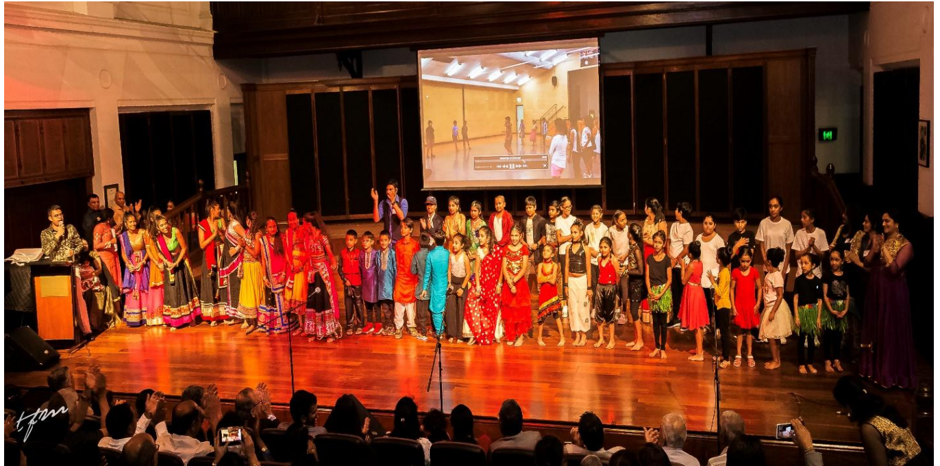
All 55 Performers Got Together on Stage at the End of the Program

This function was a great success which helped us reach new community members of Perth and at the same time raised about $4000 to sponsor 8 Ekal schools.