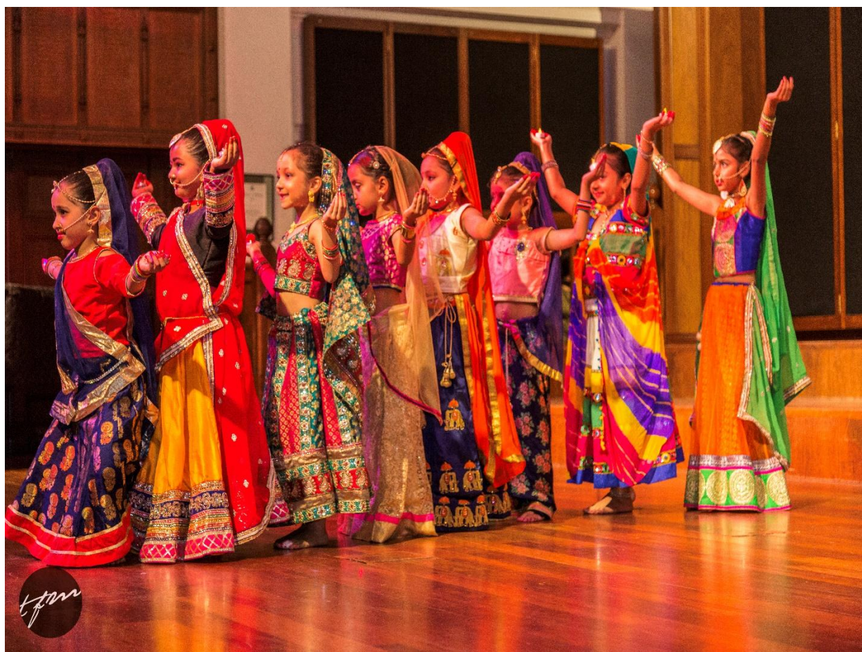
Young Girls Performing in Ran Birangi Program in Perth, Western Australia

The theme of the program was stages of human life from childhood to adulthood. The main focus of the program was team work, with the help and contribution of each other we can make a big difference in the society. The response of the program was overwhelming and audience has appreciated the effort put by the kids and volunteers in the program.