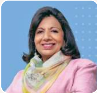
Kiran Mazumdar Shaw Founder and CEO, Biocon