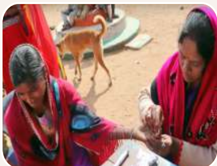
HEALTH Arogya With Telemedicine - 1200 Villages impacting 1.7 Million People (Target for 2025 - 36,000)