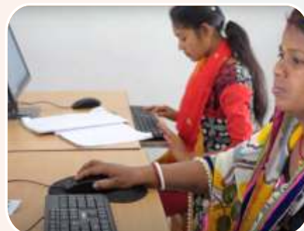
LIVELIHOODS Computer Training Center 32 Centers, 4410 - Beneficiaries