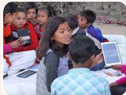
DIGITAL LITERACY E-Shiksha in - 1170 Ekal Schools 36,000 Children (Target for 2025 - 3,300)