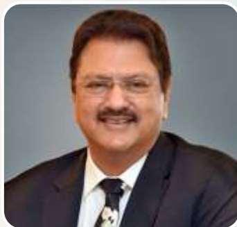
Ajay Piramal Chairman of the Piramal Group