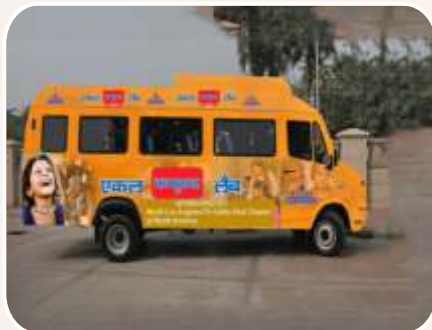
DIGITAL LITERACY 36 Ekal on Wheels (EOW) (Mobile Computer Labs) 14,770 - Beneficiaries (Target for 2025 - 60)