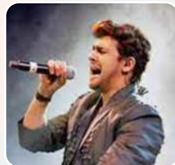
Sonu Nigam Playback Singer