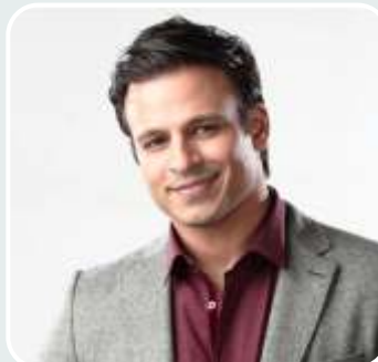
Vivek Oberoi Ekal Ambassador Bollywood Star, Philanthropist