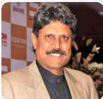
Kapil Dev Cricketer