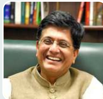
Piyush Goyal Cabinet Minister, Government of India