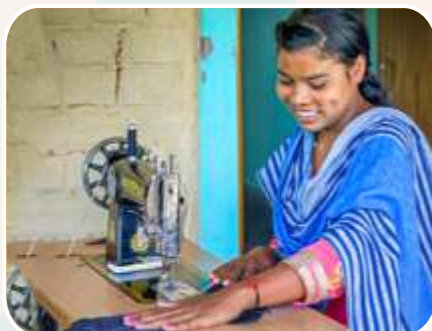
LIVELIHOODS Tailoring Training Center - 41 Centers, 10,268 Beneficiaries (Target for 2025 - 150)