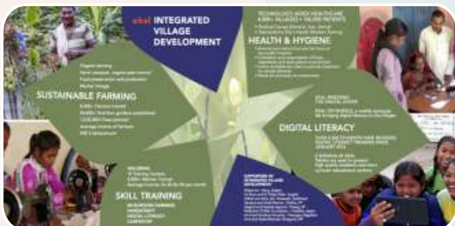
Integrated Village Development (IVD) Literacy, Digital Literacy, Health, Livelihoods - 24 Centers , 3.6 Million People (Target for 2025 - 36)